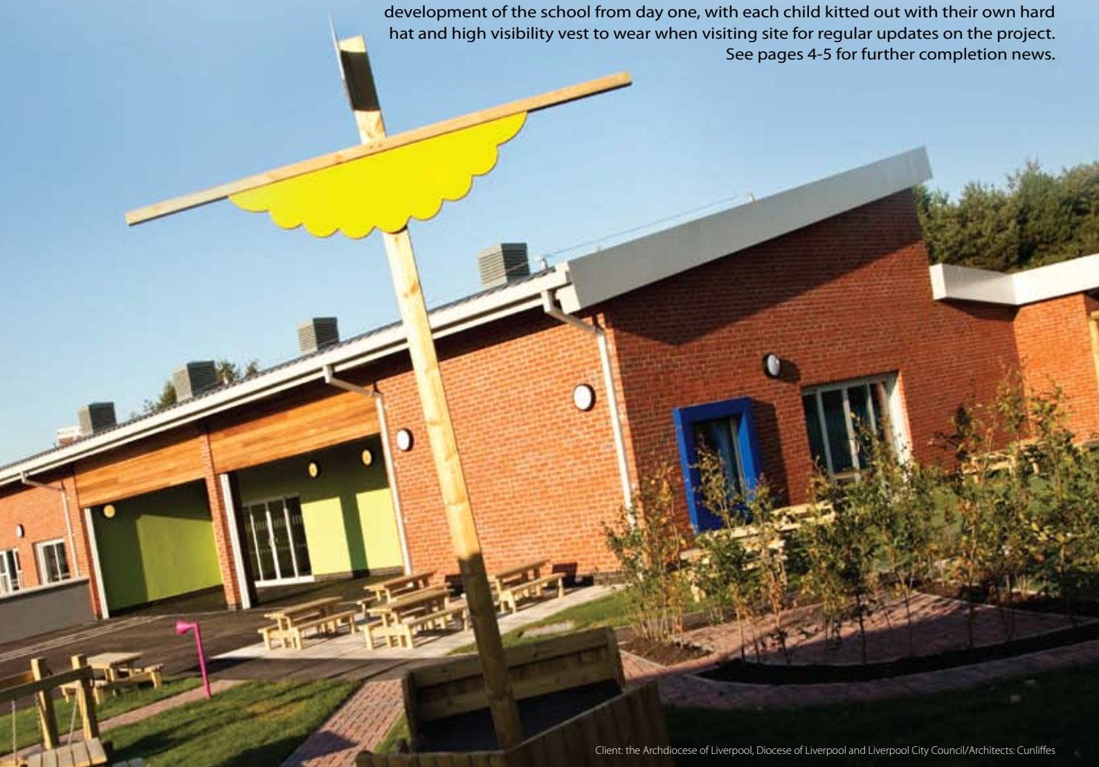
Client: the Archdiocese of Liverpool, Diocese of Liverpool and Liverpool City Council/Architects: Cunliffes

See pages 4-5 for further completion news.