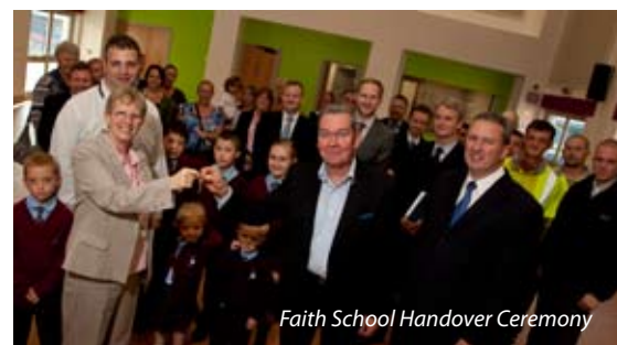
Faith School Handover Ceremony

Although the team worked in a live environment, the project ran smoothly and the college staff and pupils were delighted with the results.