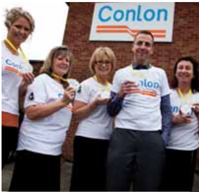
The Conlon team at the UK Corporate Games

Whilst the common theme was enthusiastic participation, our teams met with varying degrees of success. Medals were awarded in bowling, table tennis, golf and running, supplemented by hard-won points in the final stages for badminton, karting and poker. Our cricket and squash 'athletes' failed to trouble the judges! Everyone thoroughly enjoyed the experience and in the midst of three days of sport, we enjoyed taking part in a grand parade of 4,000 athletes through the city and a vibrant fancy dress party.