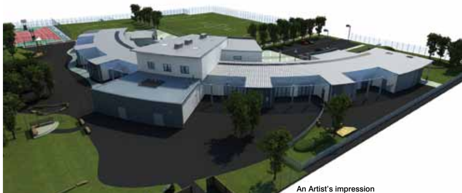
An Artist's impression

The old school will then be demolished to allow completion of the project and full occupation of the new school. We are well versed in meeting the challenges that arise on occupied school sites and are delighted to have been appointed to this project by Lancashire County Council.