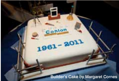
Builder's Cake by Margaret Cornes

Our actual birthday was 24th November 2011 and we marked the occasion in the office with a proper builder's birthday cake washed down with champagne; whilst on site, balloons and cupcakes were the order of the day.