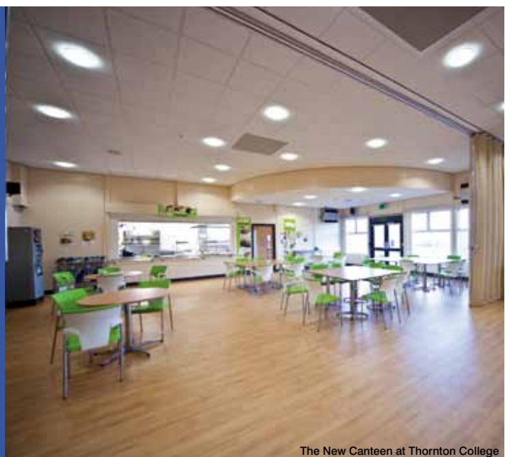
The New Canteen at Thornton College