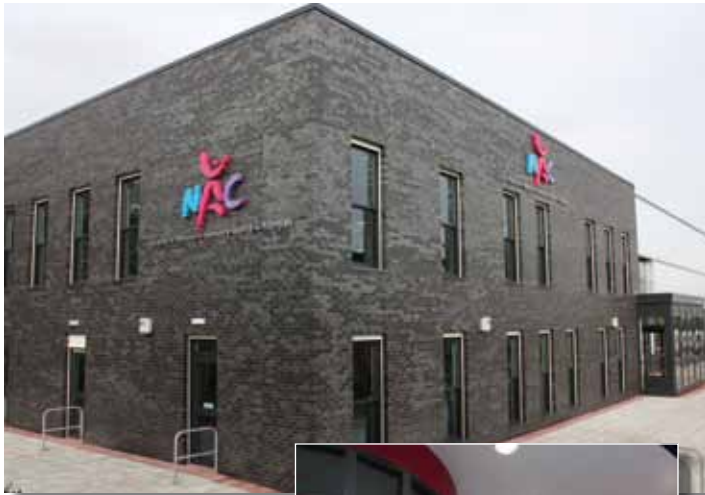
Netherton Activity Centre

Our first completion of 2012 was the Netherton Activity Centre, Sefton. The £5.6m centre is the first of its kind in the North West to offer a combined leisure centre, library and 'Jake's Sensory World', a facility for disabled visitors.