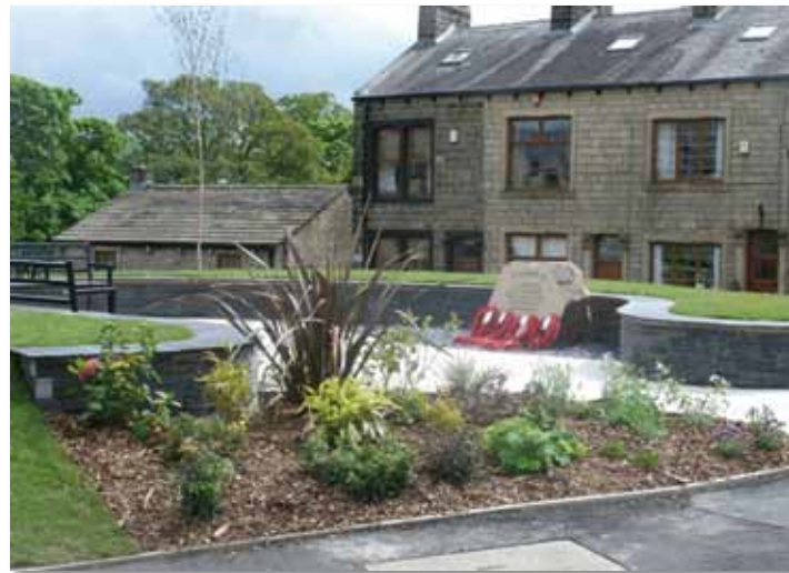
The Memorial Garden at Laneshawbridge

Most recently, we have pledged to support youth charity OnSide North West , for three years. The charity's aim is to build a network of 21st Century Youth Centres across the region, providing youngsters with quality, safe and affordable places to go in their leisure time.