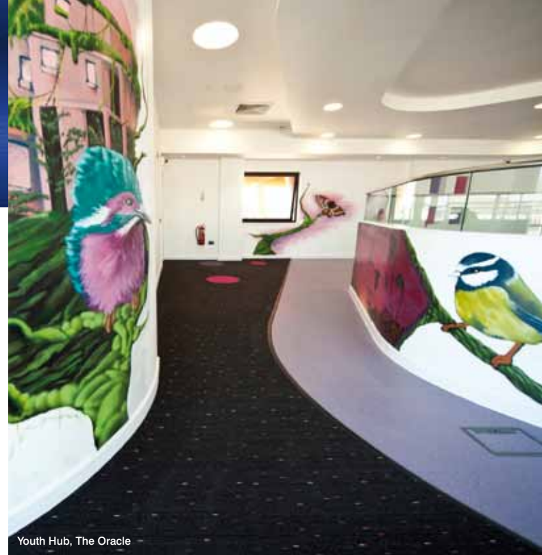
Youth Hub, The Oracle

In September UCLan opened its cutting-edge new clinic in the School of Dentistry. These first-class facilities enable students to train as future dentists and existing practitioners to enhance their expertise. The £1.3m project involved conversion work to the Harrington Building and construction of a single-storey extension, finished in a state-of-the-art zinc cladding system. The finished clinic has delighted everyone, with staff, students and patients all leaving with big smiles.