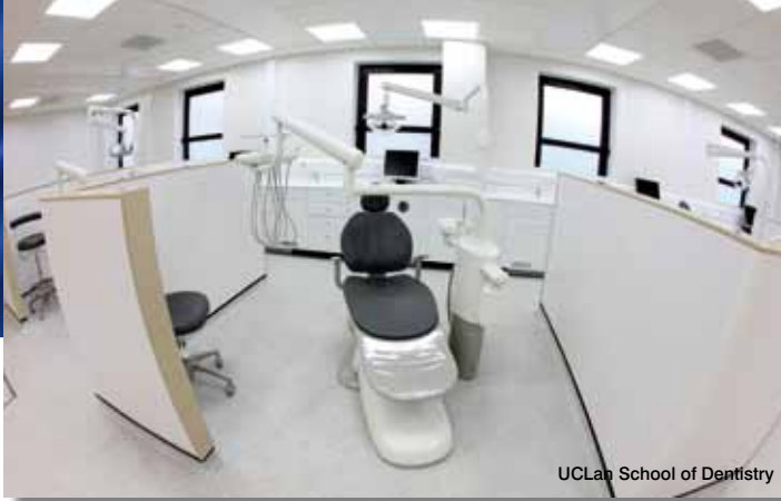
UCLan School of Dentistry