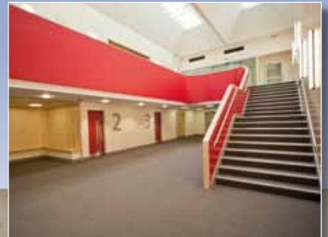
Right: A New Reception Hall Below: A New Lecture Theatre at the UCLan Foster Building

The £1.9m project transformed a disused sports hall into a magnificent new educational space which includes a reception hall and three state-of-the-art lecture theatres alongside a new medical centre.