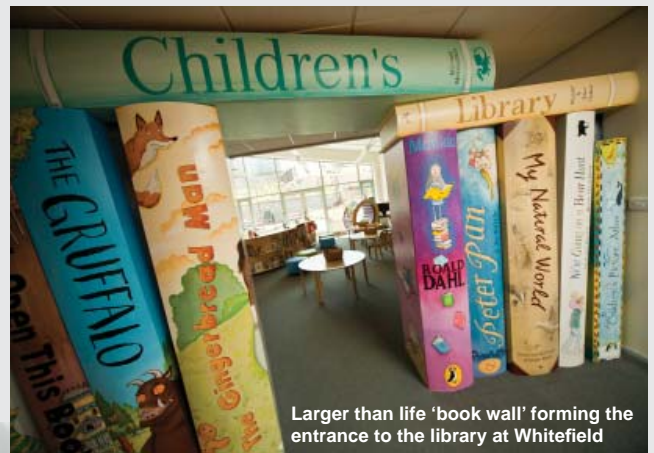
Larger than life 'book wall' forming the entrance to the library at Whitefield

Both schools have 14 classrooms with modern kitchen and dining facilities.