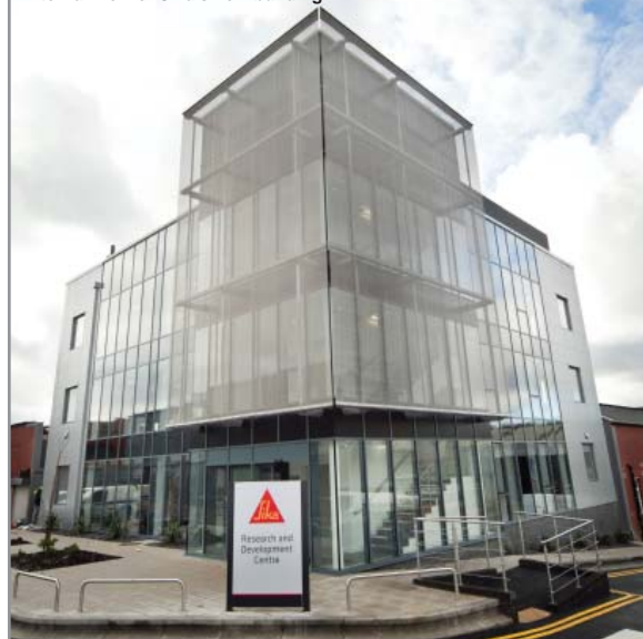
External view of Sika's new building

This project enabled the college to centralise the School of Sport from across various areas of the college.