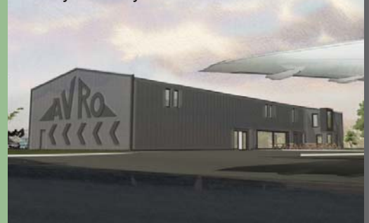
Architect's Impression of The Avro Heritage Museum courtesy of Cassidy + Ashton

A new, £1.6m Heritage Museum at the former Manchester Woodford Aerodrome site is underway. Fully funded by BAE SYSTEMS, former owners of the site, the building will house AVRO Heritage Trust's extensive catalogue of aviation history documents and exhibits, including a renovated Vulcan Bomber.