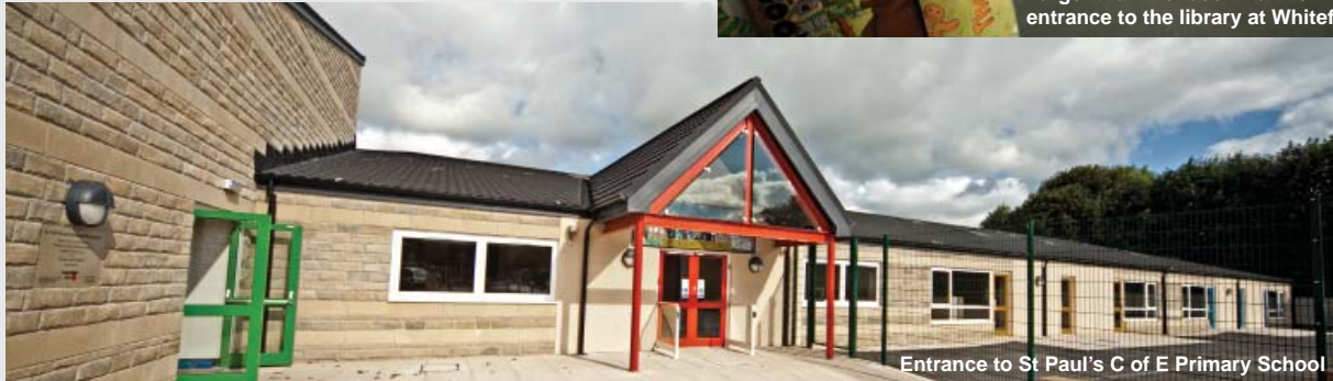
Entrance to St Paul's C of E Primary School