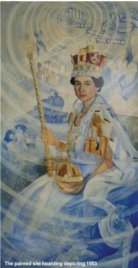
The painted site hoarding depicting 1953

The extension was in keeping with the design, materials and construction of the existing school.