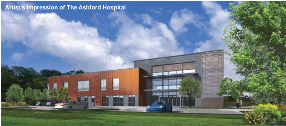
Artist's Impression of The Ashford Hospital

Below is a selection of projects we are pleased to have been awarded during 2014