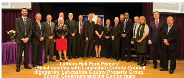
Lytham Hall Park Primary official opening with Lancashire County Council dignitaries, Lancashire County Property Group, School Governors and the Conlon team

Strategy' for current and potential new Clients. The purpose of the day was to become more effective in our communications thereby improving the performance of our departments and the business as a whole.