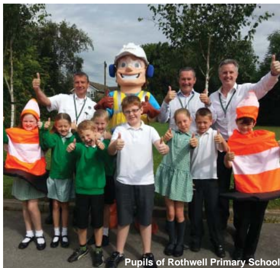
Pupils of Rothwell Primary School

We have met over 400 companies at these events, in order to strengthen our existing supply chain.