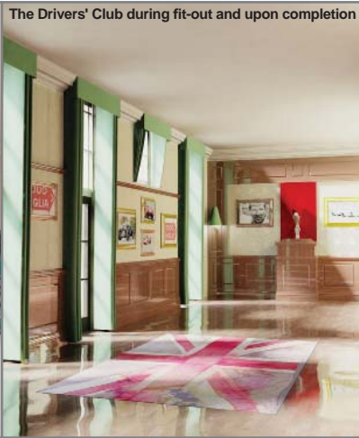
The Drivers' Club during fit-out and upon completion