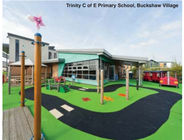
Trinity C of E Primary School, Buckshaw Village

Other works included fitting out The Drivers' Club within the 19th century Hall; converting a cricket pavilion and other redundant buildings into office space, together with a new restaurant.