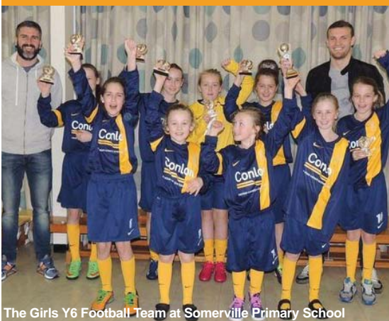
The Girls Y6 Football Team at Somerville Primary School

We wish all teams the best for the 2014/15 season.