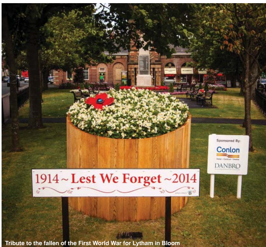
Tribute to the fallen of the First World War for Lytham in Bloom

Our final contribution was a 'Beans to Brew' coffee machine. This enabled the centre to create a coffee bar area for carers to relax, knowing their loved ones were safe nearby.