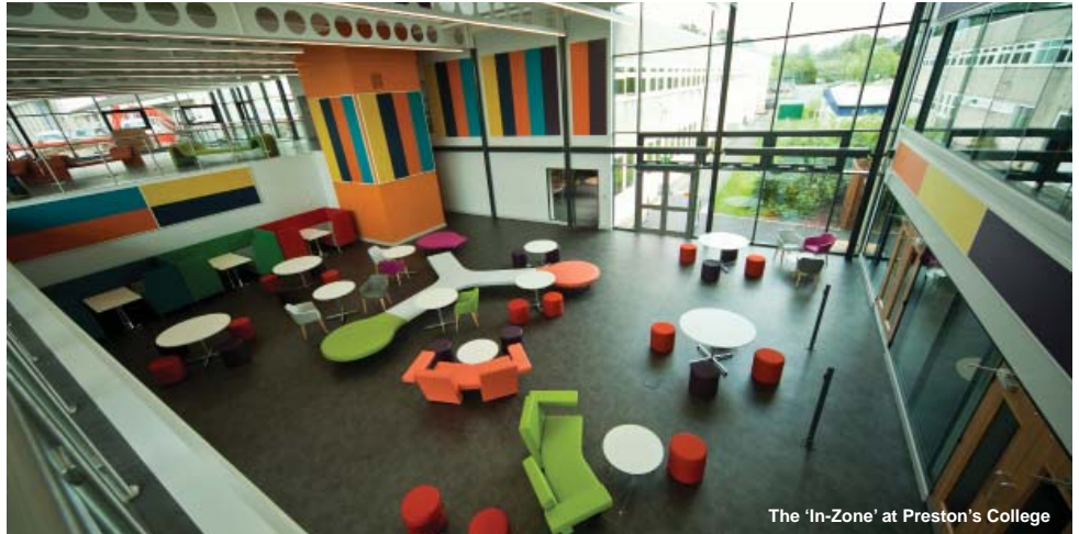
The 'In-Zone' at Preston's College