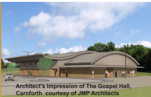
Architect's Impression of The Gospel Hall, Carnforth courtesy of JMP Architects

A £1.5m project, comprising the shell construction of a new 8-pew Gospel Hall. Works include concrete walling; raised seam cladding to curved roof; rainwater harvesting; landscaping and forming of access roads; car parking; coach parking and external lighting.