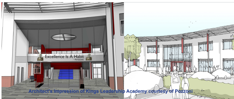
Architect's Impression of Kings Leadership Academy courtesy of Pozzoni