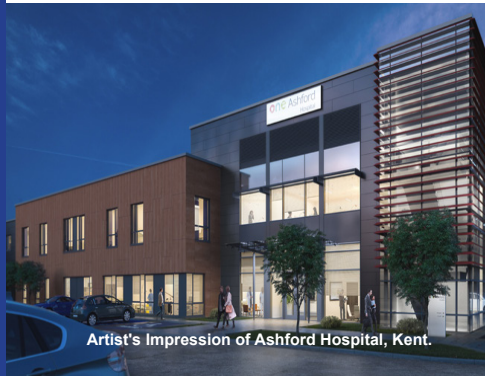
Artist's Impression of Ashford Hospital, Kent.