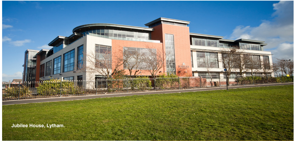
Jubilee House, Lytham.

By focusing on the building's environmental, social and economic benefits over the whole life of the hospital the team have achieved a BREEAM Excellent rating.