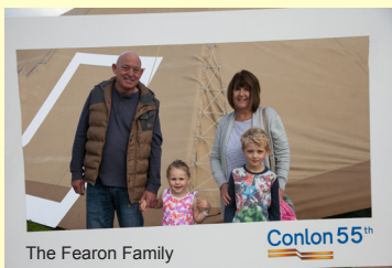
The Fearon Family