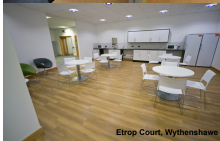
Etrop Court, Wythenshawe