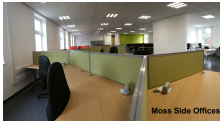
Moss Side Offices

Volumetric Design and Construction of a new, 2072m 2 , two-form entry, Community Primary School. The new school was completed in February 2016 and provides space for 420, 4-11 year old pupils.