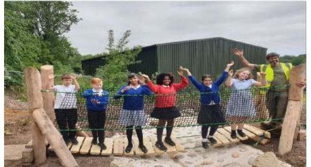
Pupils from Bowker Vale Primary School visited Heaton Park Play Area in June and built a bridge in a day! With guidance from Wild Hart Ltd.