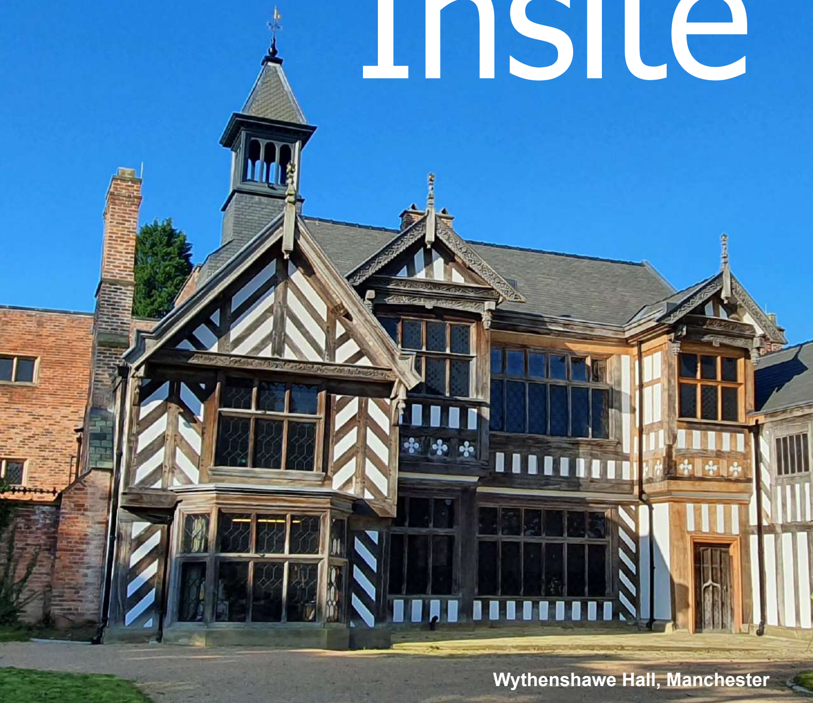
Wythenshawe Hall, Manchester