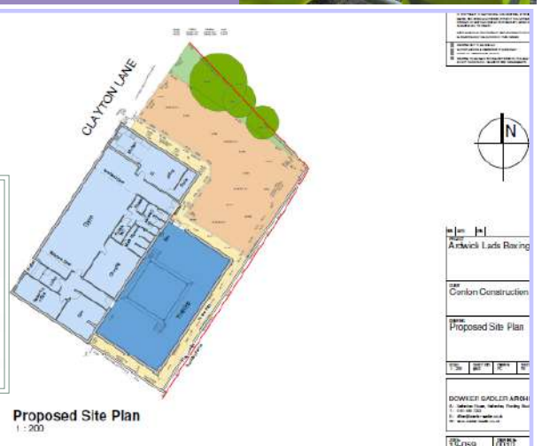
In collaboration with Engie we have assisted Ardwick Lads Amateur Boxing Club, Openshaw, in producing a fully priced, fully designed feasibility study for an extension to the rear of the boxing club.