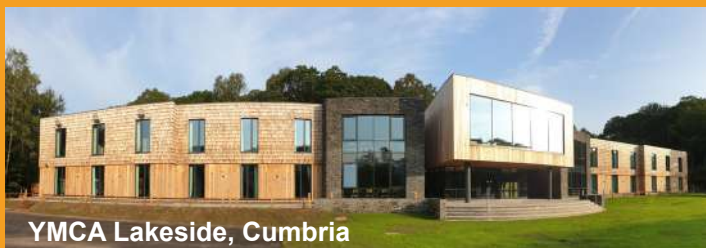
YMCA Lakeside, Cumbria