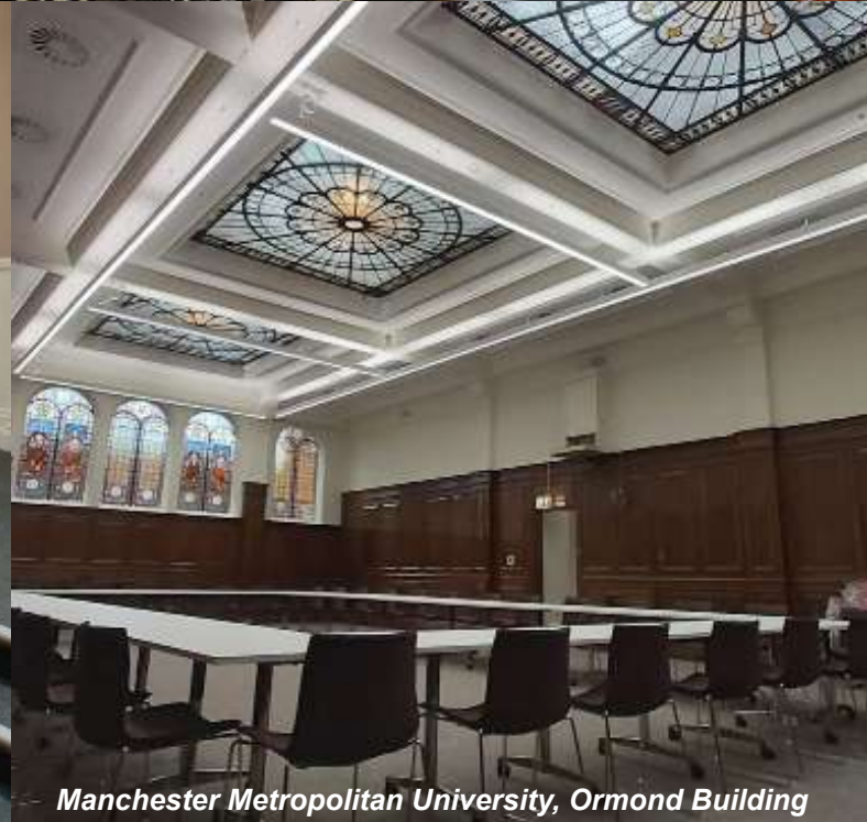
Manchester Metropolitan University, Ormond Building