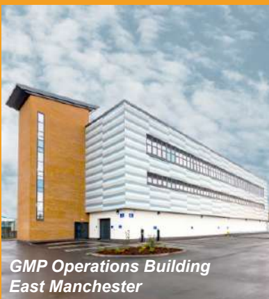
GMP Operations Building East Manchester