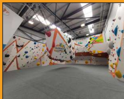
Summit Up Climbing Centre, Oldham