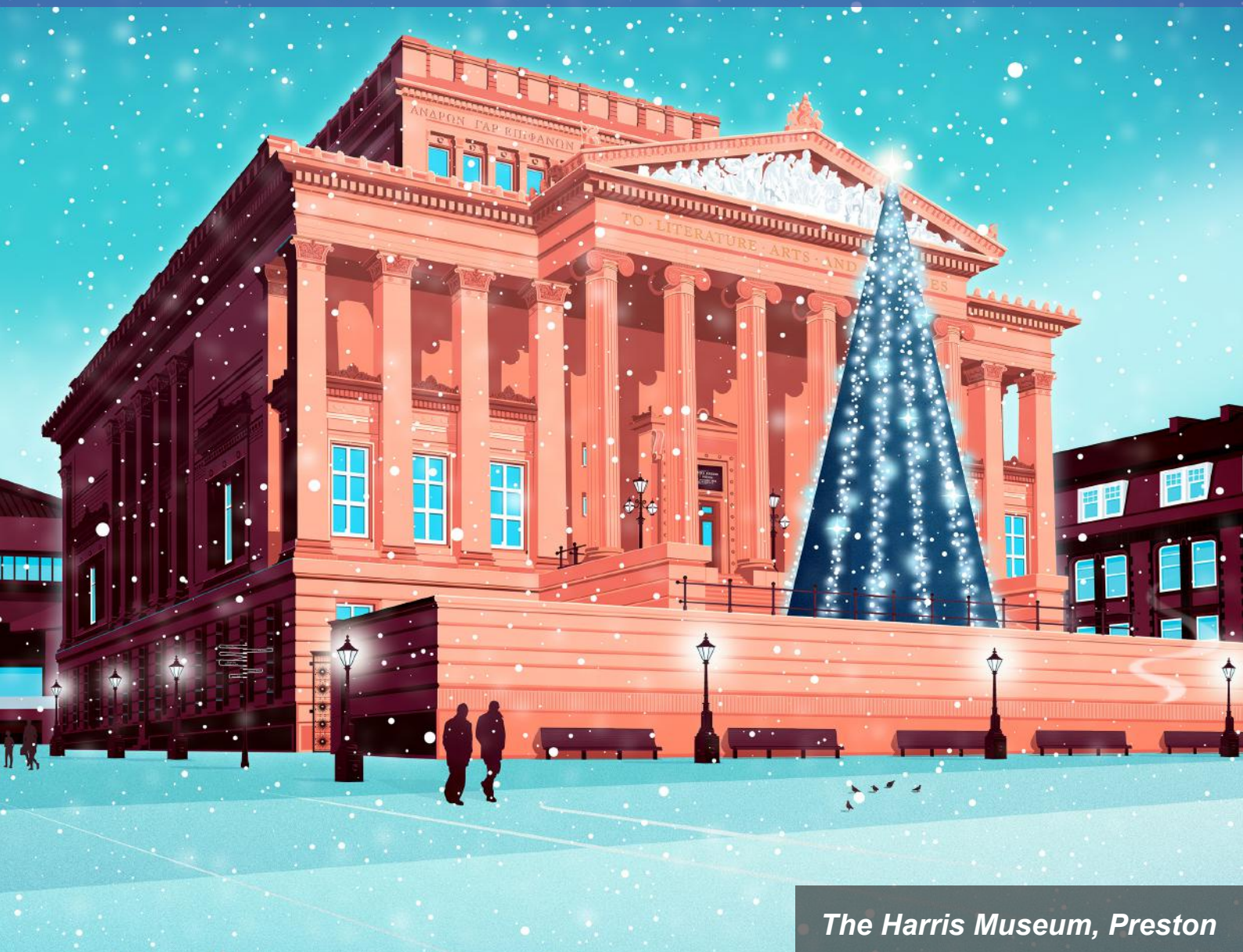
The Harris Museum, Preston