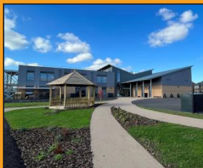
Woodford Garden Village Primary School, Stockport